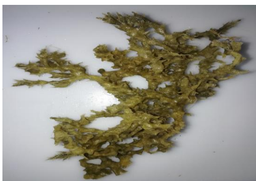
Fig. 1. Collected Rosenvingea sample from Bay of Bengal

Rosenvingea samples were collected from the southernmost tip of the country, St. Martin Island of Bangladesh, roughly between 20°37'16.9.32" N and 267°41'11.256" W and separated by a channel from the mainland about 13 km (Figure 1). Water temperature and salinity of the collection area fluctuated from 22-29°C and 21.0-33.5 PSU respectively, and average turbidity was 1.5 m to 8.0 m in shoreline (Khan et al., 2016).