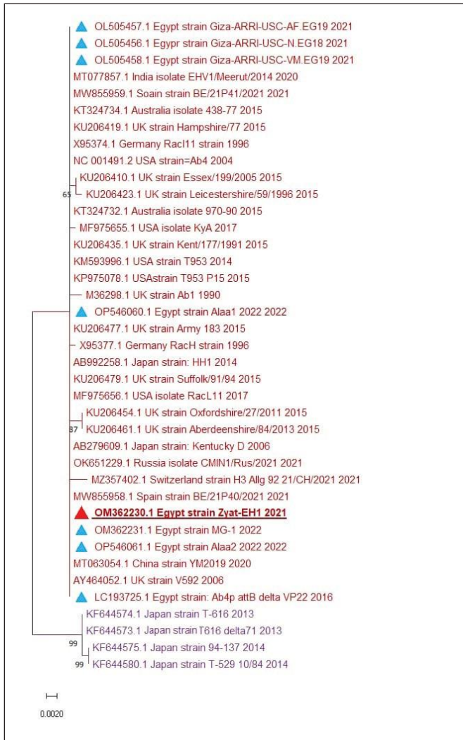
Figure 1. Phylogenetic tree of EHV-1.