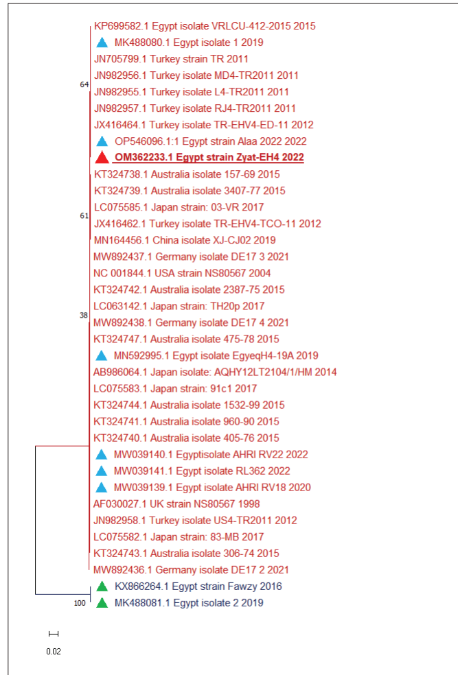
Figure 2. Phylogenetic tree of EHV-4.

Propagation of molecularly identified samples on MDBK cell culture for three successive blind passages. Control prescriptions show confluent monolayer cells (Fig. 3A). The cytopathic effect (CPE) appeared after 3 days from