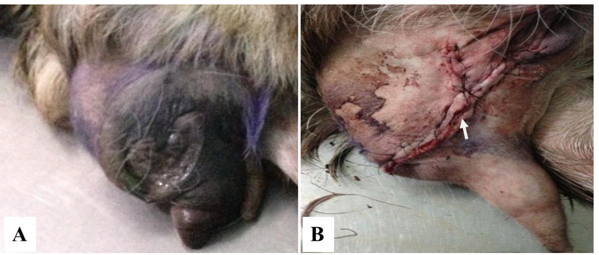
Figure 2: (A) udder before surgery having black discoloration and sloughing of tissue leaving an open wound. (B) After surgery (Mastectomy) of right quarter; arrow indicates the skin suture.

inflammatory process in mammary glands. Evolution of the process is characterized by discolored (blueblackish or blue-greenish) and cold udder, development of abscess with a demarcation line of the affected tissue, and draining pus (Ribeiro et al., 2007); similar findings were observed in our study. In a study, Vautor et al. (2009) reported that mastitis occurred more frequently in ewes, and suffered from a severe unilateral attack of mastitis originated Staphylococcus. S. aureus is accused to cause subclinical mastitis, but also might cause acute clinical mastitis or gangrenous mastitis (Contreras et al., 2003). Etiological agent is crucial to determine the therapeutic regime. Combined infection by S. aureus, C. perfringens and E. coli in gangrenous mastitis in goats was reported in Brazil by Ribeiro et al. (2007). In another study, Pal et al. (2011) reported six clinical cases of gangrenous mastitis in goats caused by E. coli alone or mixed infection with S. aureus; these were in line with our