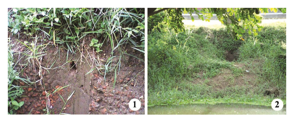
Figs. 1-2: 1. Nest of common kingfisher. 2. Nest of common kingfisher beside a water body.

Nest site selection and territory establishment: After pair formation, both the partners selected abandoned and isolated nest sites, near or away from human habitation (Figs. 1-2). They chose a vertical, sandy-loam area where they could dig holes comfortably. The pair searched for newly cut down slopes or eroded hills/heaps at the bank of the lake, pond, river, or near the paddy field and ditch (Naher and Sarker 2016).