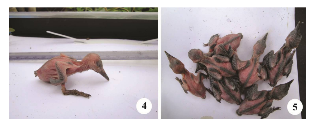
Figs. 4-5: 4. Physical feature of the hatchlings of common kingfisher. 5. Physical feature of the nestlings of common kingfisher.

Physical feature of the hatchling: The newly hatched hatchling was naked with transparent body skin and flesh colored. The beak and claws were black. Eyes were closed. Eyelids appeared large and dark gray. Egg tooth was present which were disappeared at the 7<sup>th</sup> to 9<sup>th</sup> days of hatching. The claw, wing, and tail feathers were absent (Figs. 4 and 5). The measurement of hatchlings and fledglings is represented in Table 3.