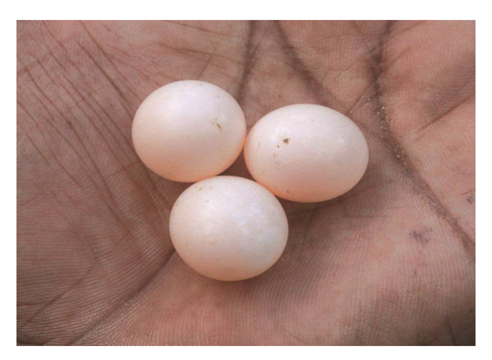
Fig. 3. Eggs of common kingfisher.

The egg was almost round (Fig. 3). Flegg (1984) and Jerdon (1982) reported such a shape. Whistler (1986) and Ali and Ripley (1987) described the spherical-shaped eggs.