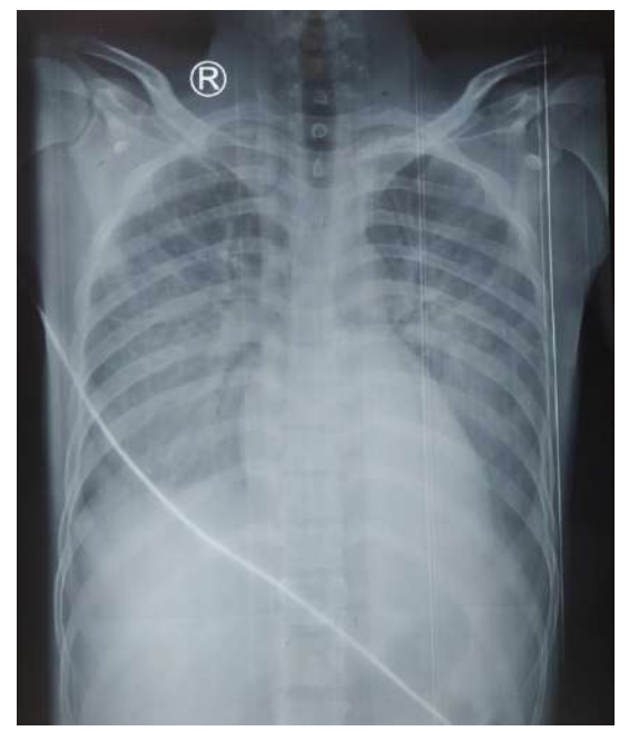
Figure-3: Cardiomegaly with Bilateral plural effusion