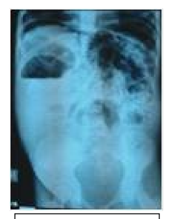
Fig-3: X-ray abdomen showing pneumoperitoneum with dilated loops of intestine