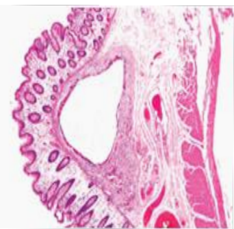
Fig-6: Microscopic view of pneumatosis cystoides intestinalis showing cystic spaces