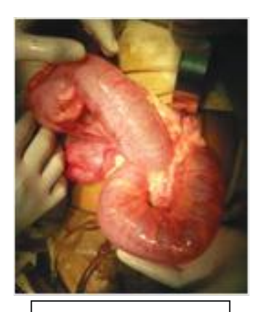
Fig-4: Distended bowel loops 01 exploration