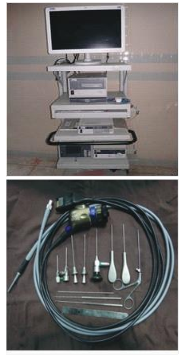
Fig-1: TMJ Arthroscopy Machine and Accessories.