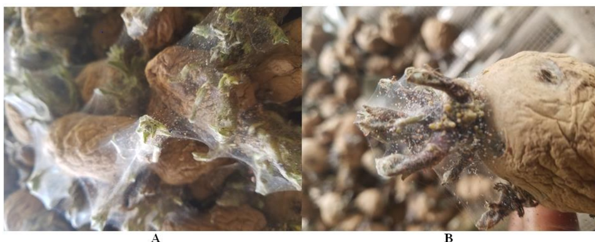
Figure 1. Potato tubers infested by the two-spotted spider mites in KARC DLS. (A) Tubers covered by spider web-like structures; (B) A swarm of eggs and adults of mites on sprouted potato tubers and dried tips by TSSM infestation.

al. , 2017). The study of spider mite population dynamics, prompt control of their numbers in agro- and biocenosis, and the removal of trade barriers based on international plant quarantine are all dependent on the accurate identification of spider mite species (Li et al. , 2015; Razuvaeva et al. , 2023). The Tetranychidae family is currently diagnosed using biochemical (protein-based) and molecular (DNA-based) approaches, as well as identification by adult morphological trait techniques (Razuvaeva et al. , 2023). The principles of the morphological approach for identifying spider mites have made a significant contribution to the management and ongoing scientific study of the pest, in which the concepts derived from earlier research remain applicable (Mitrofanov et al. , 1987; Mehle and Trdan, 2012; Popov, 2013; Konoplev et al. , 2017).