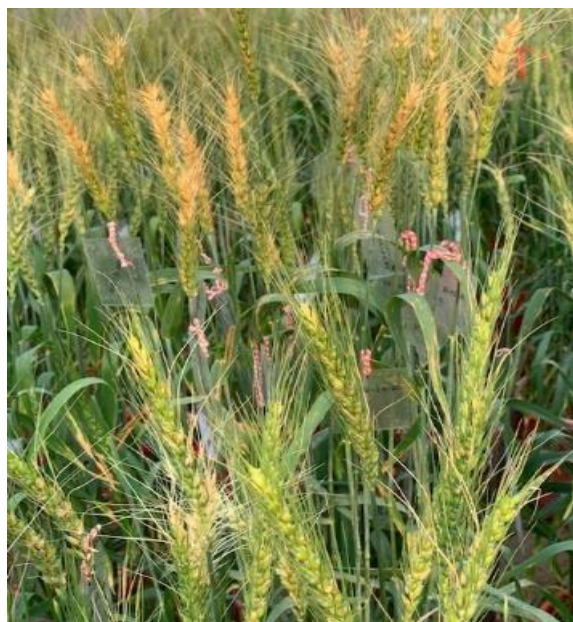
Fig. 3. Typical spike bleaching of wheat plants of variety BARI Gom26 inoculated with Magnaporthe oryzae Triticum in the BINA net house.

Symptoms appeared approximately 14 days after inoculation in untreated (control) plants. The treated plants also showed blast infection almost at the same time. Typical blast symptoms of spike bleaching advancing from top to downward were observed (Fig. 3).