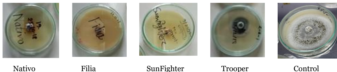
Fig. 2. Growth of Magnaporthe oryzae Triticum on PDA poisoned with fungicides at 20 days after inoculation.

Out of eight fungicides, Nativo, Sunfighter, Filia and Trooper completely inhibited the mycelial growth of M. oryzae Triticum (MoT). Other seven arrested the growth of MoT at different levels (Fig. 2).