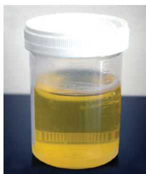
Figure 4: Urine sample 2 weeks after sclerotherapy