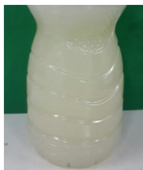
Figure 3: Pre-procedure urine sample