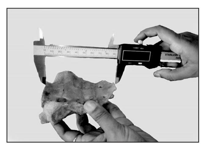
Figure 1 Maximum length of sacrum is being measured

viii) Auricular Index: Length of auricular surface/Width of sacrum x 100.