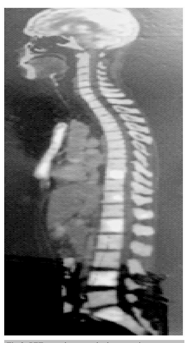
Fig-2: PET scan show vertebral metastasis.

normal pupils and color vision, minimal reduction of extraocular motility. After initial non responsive steroid therapy, orbital and cranial MRI was performed. The MRI showed a diffuse SOL involving right sub-frontal, supra & retro-orbital region, in the region of right half of the frontal sinus and anterior to sella turcica. The lesion invade right retro-bulbar region mostly from postero-lateral and superior aspect. The lesion extending to both ethmoidal sinuses (marked in right side), shenoidal sinuses, right posterior nasopharyngeal space, right half of nasal cavity and right maxillary antrum with minimal invasion to the inferior & lateral aspect of right frontal lobe also noted. The tumor was resected on April 2014 through bi-coronal craniotomy. On section, it showed nests of anaplastic cells arrange in cribriform pattern producing gland like spaces. Histologic report was adenoid cystic carcinoma, originated from lacrimal gland (Fig-1).