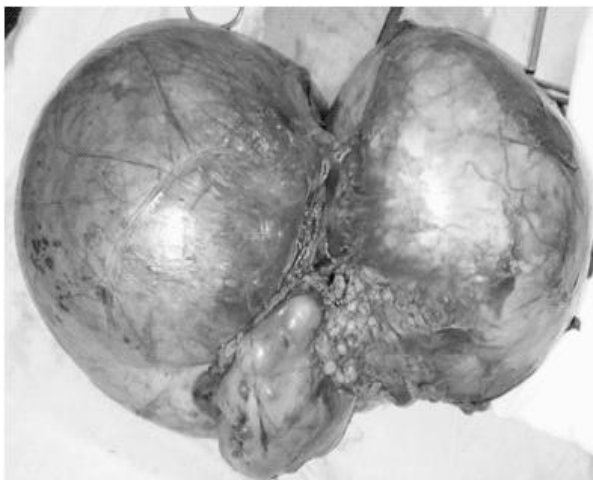
Figure 2: Excised mass

With above findings we planned for excision of retroperitoneal mass with left sided nephrectomy. Abdomen was opened by long left paramedian incision. After mobilizing left side colon we found a huge cystic swelling with two protuberances (Fig. 2). The cortex of the kidney was thinned out to a fibrous rim and attached to the cystic swelling. Left renal artery and vein were ligated and the mass was excised. On cut section of the mass, it was cystic involving the renal pelvis and calyces, which was filled with greyish-green gelatinous mucus. The cortex of the kidney was thinned out to a fibrous rim. A diagnosis of mucinous cystadenoma arising from the renal pelvis was made on histopathology report. During the 15 months follow-up, the patient was well and no recurrence of the neoplasm occurred.