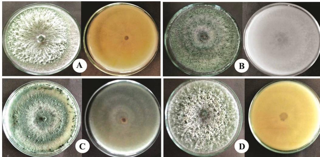
Plate 2. Colonies show front and reverse side of different isolates of Trichoderma spp. on PDA medium after 5 th day of inoculation. A. T. reesei type 4, B. Trichoderma viride type 5, C. T. viride type 6, and D. T. viride type 8.

Colony of isolate type 4 showed scattered minute tufts, pale yellowish-green in colour, colony reverse was pale yellowish. Conidiophores were rarely branched and verticillate. Phialides shape were cylindrical or slightly inflated and divergent phialides. Conidia shape was ellipsoidal. Chlamydospore was frequently produced both terminally