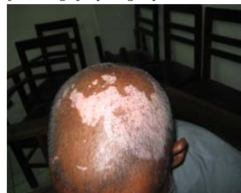
Picture 5: showing vitiligo affected area on scalp region of an old man.