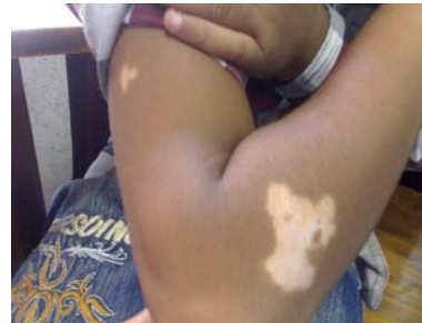
Picture 3: showing vitiligo affected area on right forearm and arm of a young boy.