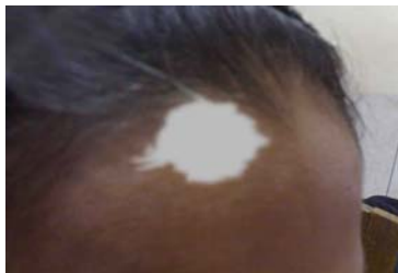
Picture 1: showing vitiligo affected area on forehead of a middle aged women.

Moreover, in a survey of more than 2600 unselected Caucasian vitiligo patients, elevated frequencies of autoimmune thyroid disease, Addison's disease, systemic lupus erythematosus and pernicious anaemia were found, with approximately 30% of patients being affected with at least one additional autoimmune disorder 8 Furthermore, these same autoimmune diseases occurred at an increased frequency in the first-degree relatives of the patients studied. Similarly, in multiplex generalized vitiligo families, higher frequencies of psoriasis, rheumatoid arthritis and type 1 diabetes mellitus were noted in addition to autoimmune thyroid disease, Addison's disease, systemic lupus erythematosus and pernicious anaemia 9 . Such data indicate that individuals can be genetically predisposed to a specific group of autoimmune diseases that includes generalized vitiligo 2 . In contrast to the studies, one notable large-scale analysis of 321 vitiligo patients found associations with thyroid disease but not with any other autoimmune disease 10 . The purpose of the present study was therefore destined to find out the association of vitiligo with any autoimmune diseases.