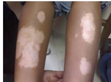
Picture 4: showing vitiligo affected area on posterior aspect of both leg of a young boy.