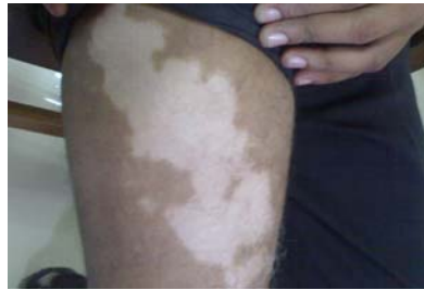
Picture 2: showing vitiligo affected area on right thigh of a young man..