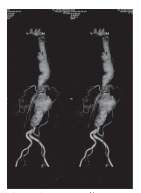
Fig: 3: Abdominal aneurysm affecting supra and infra renal region