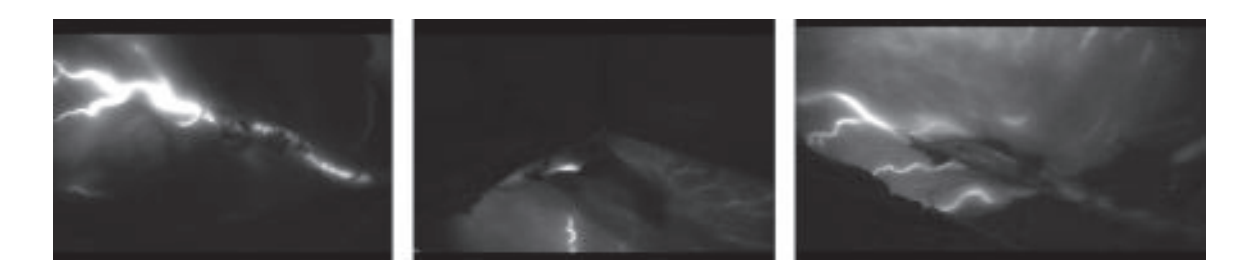
Fig 2: IFI imaging showed LIMA to LAD. A- Excellent anastomosis; B -Stenosed anastomosis and C- Narrowing of anastomosis