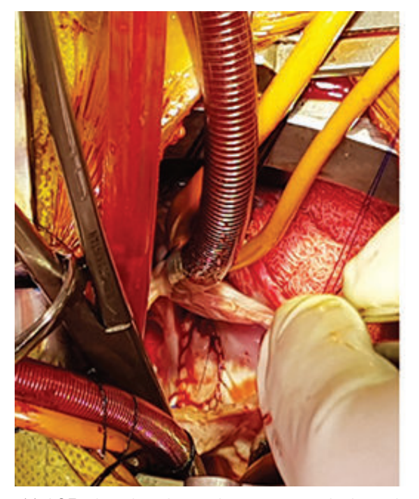
(c) ASD \ closed \ with \ autolog us \ pericardial \ patch.