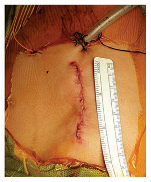
(d) Final view and length of skin incision