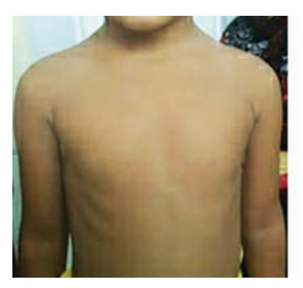
(a) No midline scar.

No asymmetrical development of the breast, thoracic deformity or scoliosis has been found. All the patients or the parents of young children in our study group were satisûed with the cosmetic results. Even the midline conversion patient was also satisfied because our team has tried for them.