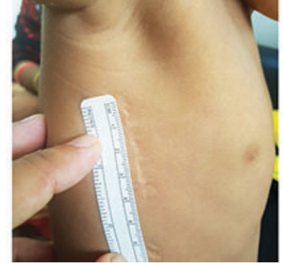
(b) Final scar under the axilla.