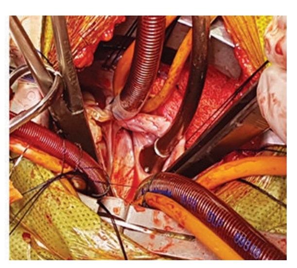
(b) Heart opened after cardioplegia and ASD in view.