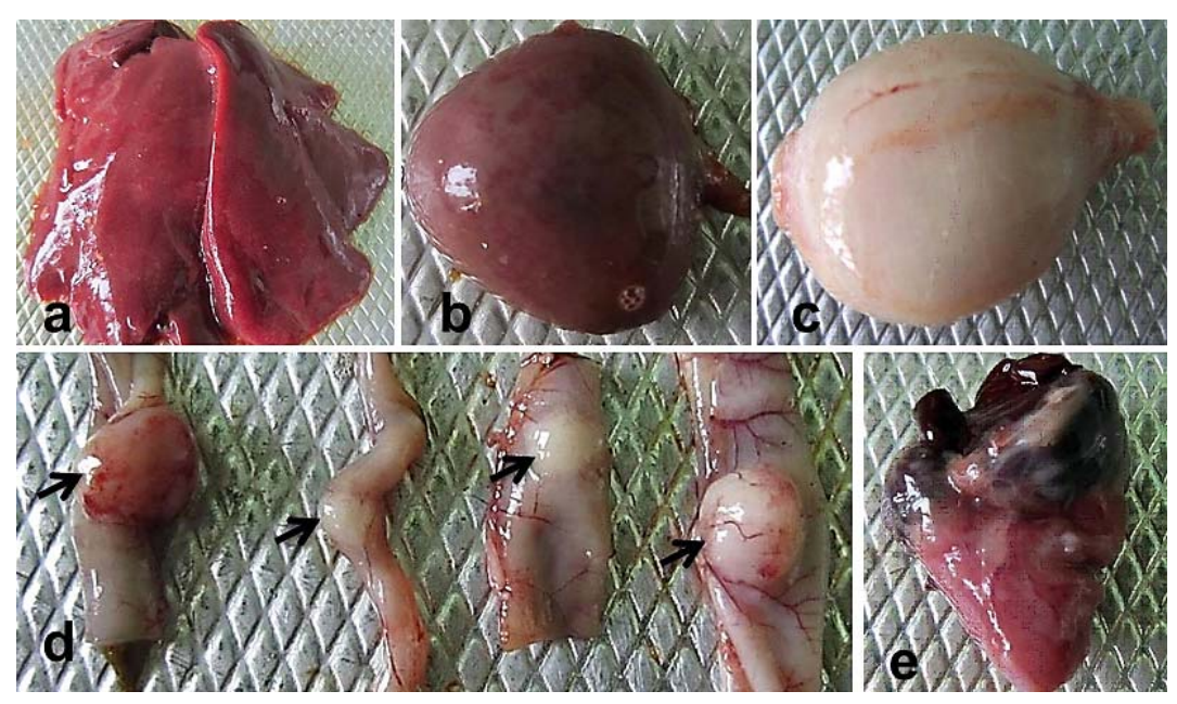
Fig. 1: Gross pathological changes in affected chickens showing (a) hepatomegaly, (b) splenomegaly, (c) thickened proventriculus, (d) tumours in intestine and (e) heart.

The distribution of tumours is shown in Table 2.The highest number of tumours was found in the proventriculus (17/23) followed by liver (13/23) and spleen (8/23). Interestingly, no gross changes were observed in sciatic nerves or brachial nerves, although some birds show significant nervous signs.