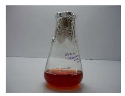
Fig. 3. Mycoplasma broth containing neotetrazolium stain

(Fig. 5). For tetrazolium-stained antigen the agglutinin was deep blue with light blue background (Fig. 6) and less easily seen. Granules developed within one minute with tetrazolium stain and two minutes with neotetrazolium stain. Since the agglutinins were suspended on colourless serum, they were easily visible to the naked eye. In conventional agglutination test with other commercial antigens the cloudy reaction was not easy to detect. The specificity of the stained antigen was good: it did not react with the negative control serum or with water.