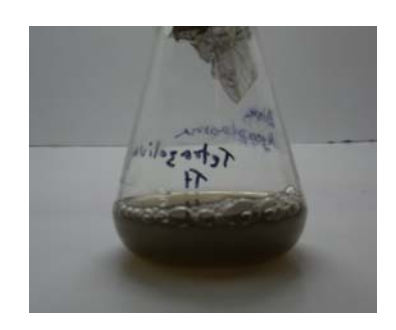
Fig. 4. Mycoplasma broth containing tetrazolium blue stain