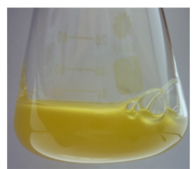
Fig. 2. Bulk culture of Mycoplasma gallisepticum in Mycoplasma broth showing turbidity and sliminess

A single colony of Mycoplasma gallisepticum from Mycoplasma agar inoculated into Mycoplasma broth formed confluent growth that showed turbidity and sliminess (Fig. 2).