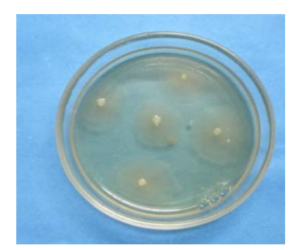
Fig. 1. White colour Mycoplasma colony showing a dense raised centre in colonies with typical fried egg appearance

minute. Serum and water were used as negative control. For proper mixing, the antigen was shaken before use. The stain that used for preparation of antigen was sensitive to light so it kept away from the light.