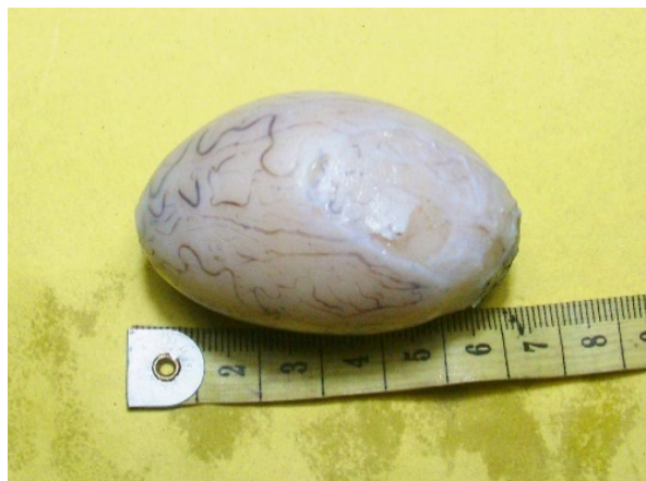
Fig. 1: Measurement of the length of the testis of bucks with scale and tape.