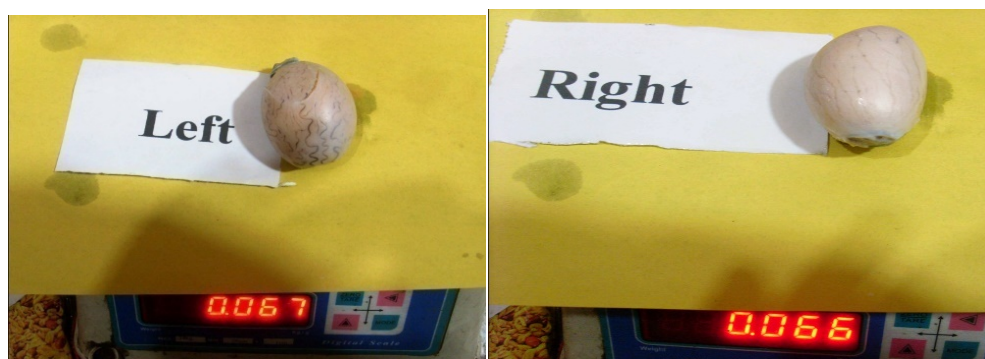
Fig. 2: Measurement of the weight of the testis of bucks with Digital weight Machine.