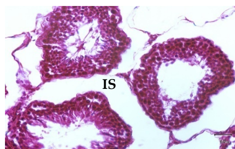
Fig. 4: Microphotograph showing interstitial space (IS). (H & E stain; x 40).