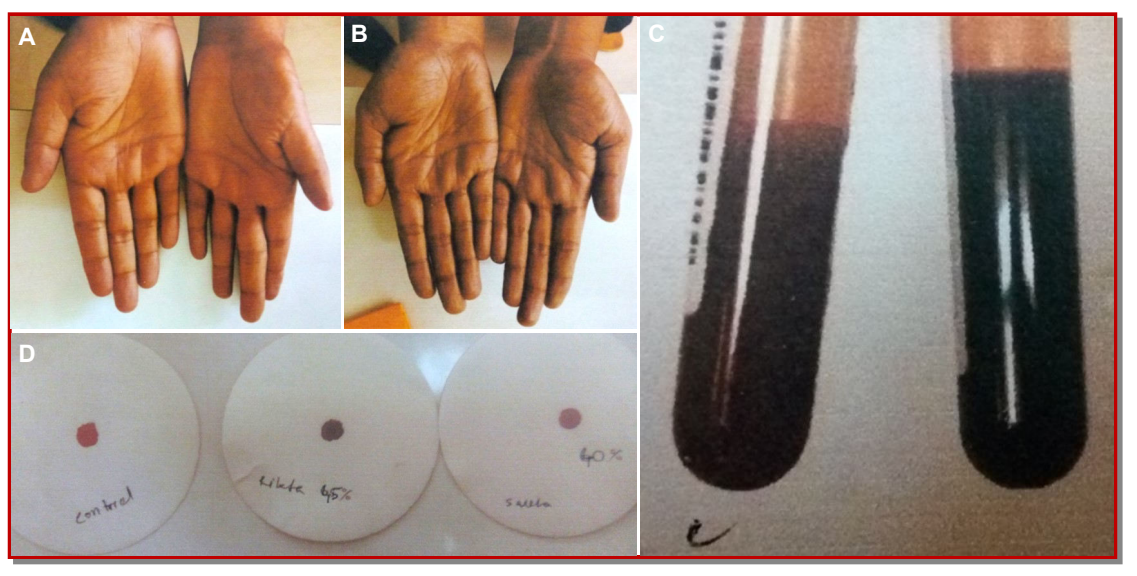
Figure 1: Patient's (A) and daughter's (B) hands showing cyanosis; Chocolate brown color of methemoglobinemia in control (C, left) and patient's (C, right) samples; Rapid screening filter paper test (D);