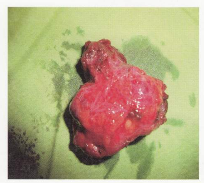
Fig-1: Photographs showing operative removal of thyroglossal duct cyst

Thyroglossal duct cyst carcinoma is very rare. This condition is rarely diagnosed pre-operatively. Once diagnosed, therapy includes total thyroid surgery, adio-active iodine therapy and thyroid suppression.