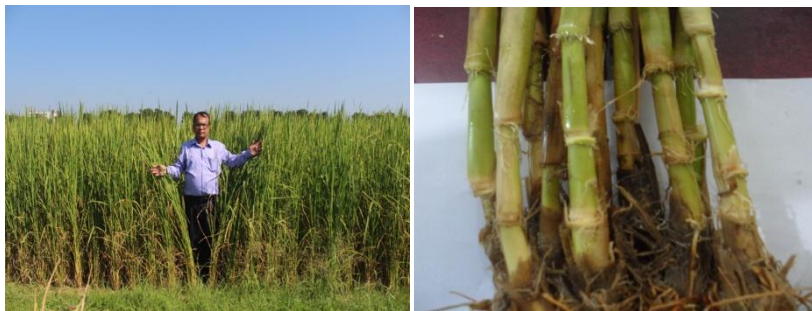
Fig. 1. BR10230-15-27-7B having tallness, strong stems and lodging tolerance

However, adaptability tests of the line BR10230-15-27-7B under multi-location trials in the farmers' field showed satisfactory performance in terms of grain yield in three consecutive seasons. Finally, after proper evaluation the NSB team recommended BR10230-15-27-7B as a superior genotype in respect to semi deep water tolerance for release as BRRRI dhan91 in 2019. Furthermore, BRRRI dhan91 could be used as a breeding material for its tallness with strong stem, submergence tolerance and moderate level of stem elongation ability.