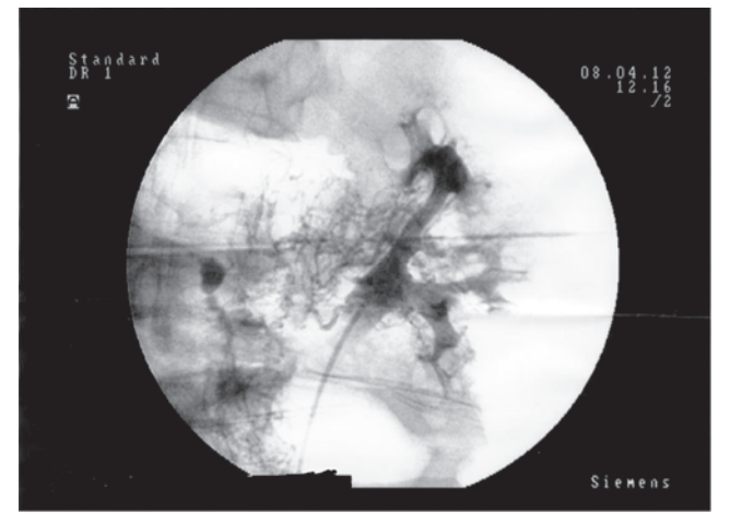
Fig:3: Fig: 3: Retrograde pyelogram showing pyelolymphatic communication.

In case-I retrograde pyelography failed to demonstrate pyelolymphatic fistula. According to right ureteric jet he was diagnosed as a case of chyluria from right kidney. But, in case-two retrograde pyelography showed left sided pyelolymphatic communication[Fig: 3]. Both patient received multiple courses of antifilarial drugs like diethylcarbamizine (DEC) and albendazole previously. Retrograde uretric catheterization & sclerotherapy with povidone iodine(0.2%) was instelled 8 hourly for 3 cosecutive days(total 9 doses). Initially, During retrograde pyelography both the patients received non-ionic contrast also. After sclerotherapy, both patients were on low fatty diet for four weeks. Gradually, their chyluria decreased & stopped. After 6 months followup both patients were passing clear urine.