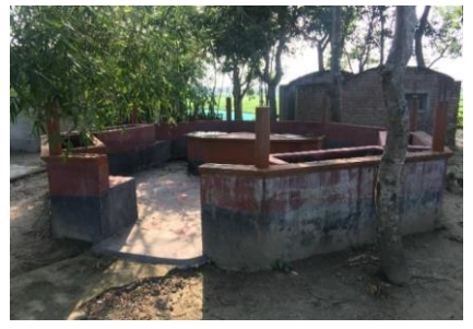
B: Snake display centre at Rajbari Snake Farm