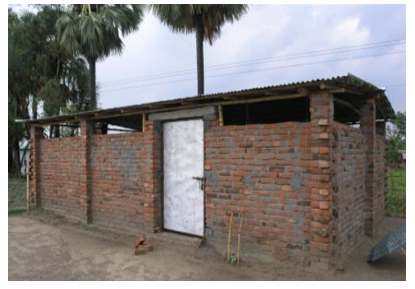
C: Snake Rescue and Conservation Centre, Rajshahi