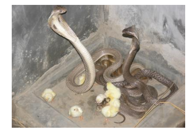
D: Snake rearing tank of Snake Rescue and Conservation Centre, Rajshahi