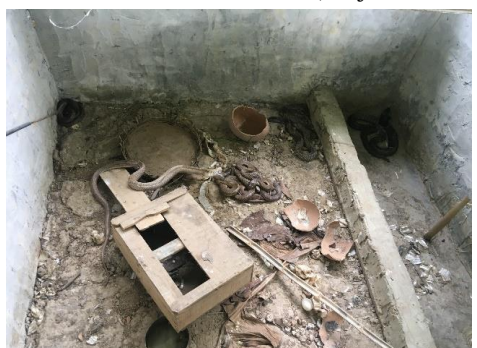
F: Snake rearing tank of Barun'sSnake Farm, Gazipur