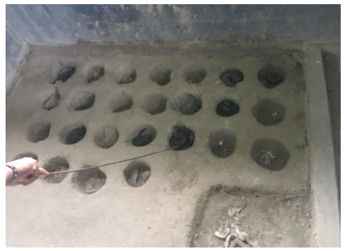
E: Snake rearing hole of Snake Rescue and Conservation Centre, Rajshahi