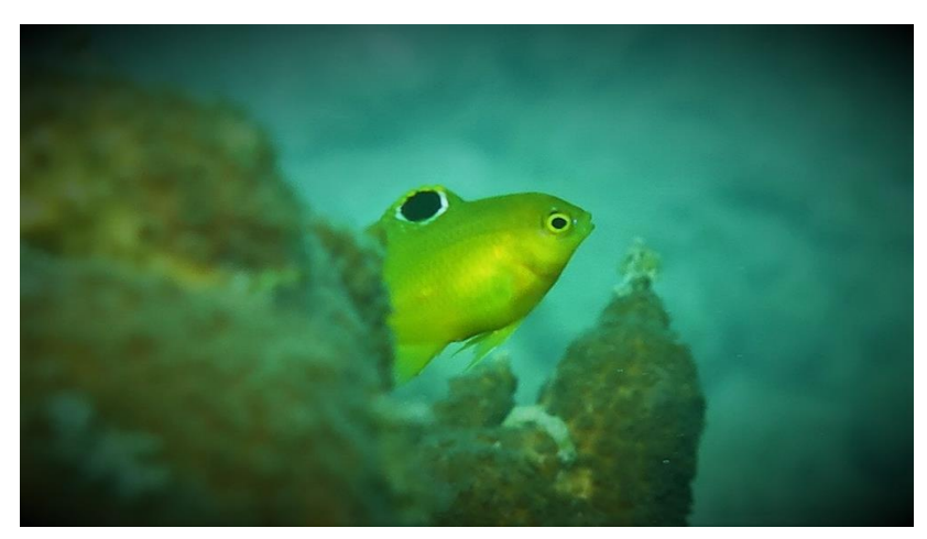
Fig. 4: Stegastes obreptus. Photo taken from Chera Dwip of Saint Martin's Island.

Material examined: Photographs of the species collected from Bangladesh: Cox's Bazar, Teknaf, St. Martins Island, Bay of Bengal (Figure 1). An underwater photograph was captured during the foraging of Stegastes obreptus around 4m of depth in the southernmost side of the St. Martin's island (Figure 5).