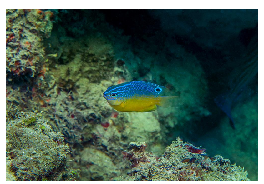
Fig. 2. Pomacentrus proteus. Photo captured from Chera Dwip of Saint Martin's Island.

Material examined: Photographs of the species were taken from Bangladesh: Cox's Bazar, Teknaf, St. Martins Island, Bay of Bengal (Figure 1). An underwater photograph was captured of P. proteus around 3 meter of depth in the southernmost of the St. Martin's Island (Fig. 2).