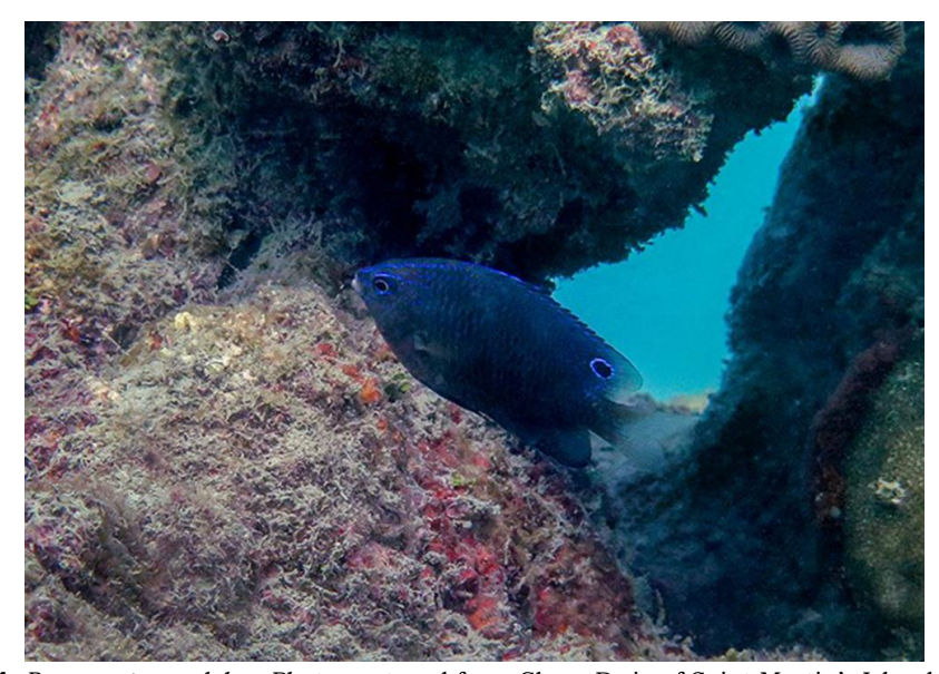
\textbf{Fig. 4:} \ \textit{Pomacentrus adelus}. \ \textbf{Photo captured from Chera Dwip of Saint Martin's Island}.

Material examined: Photographs captured from Bangladesh: Cox's Bazar, Teknaf, St. Martins Island, and Bay of Bengal (Figure 1). An underwater photograph was captured during the foraging of Pomacentrus adelus around 4m of depth in the southernmost side of the St. Martin's Island (Fig. 4).