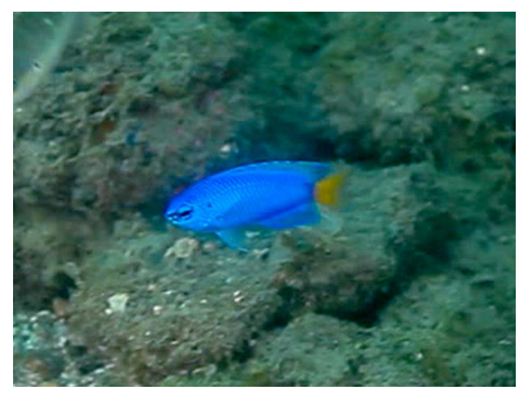
Fig. 3. Pomacentrus similis. Photo taken from Chera Dwip of Saint Martin's Island.

Material examined: Photograph of fish collected from Bangladesh: Cox's Bazar, Teknaf, St. Martins Island, Bay of Bengal (Figure 1). An underwater photograph of P. similis was captured around 3m of depth in the southernmost side of the St. Martin's Island (Figure 3).