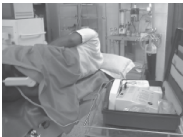
Fig 1: MIL instrument

This study was an observational study done on 30 male patients with pelvic pain and age range varied from 30 to 60 years. The study period was from 2009 to 2011 in a private medical center at Dhaka city. The MIL-therapy in use has a wave length of 904 nm and a frequency of 3000 Hz. The Laser beam reaches the prostate with a special optic probe. In this study the patient is examined per rectally after doing digital rectal examination with use of gloves and gel. It can be sterilized and it is atoxic. At the beginning we used a "Laser Super Sonic" machine with endorectal probe according to Strada. The treatment schedule was one treatment every two days (treatment's time of 5/10 minutes, wave length 1000 KHz) for a total of 10 applications. Transrectal laser therapy was not indicated in prostate larger than 4 cm because this is the maximum depth of the laser beam's efficacy.