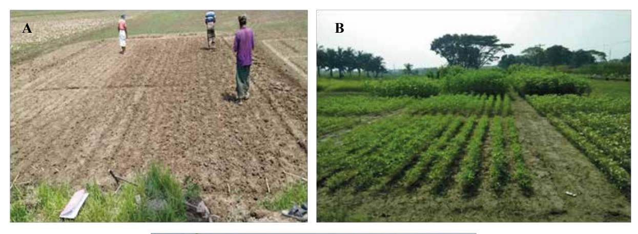
Fig. 2. Intensive supervision signifying in experimental field for good agricultural practices. (A) Land preparation (B) Experimental field, (C) Pod of Tossa jute