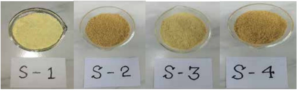
Where: S-1=Oven dry; S-2=Sun dry; S-3= Mechanical dry; S-4=Shade dry

Dehydrated ginger slices were ground using a grinder for making fine powder as shown in Fig. 1. Prepared ginger powder was stored at 4°C in low dense airtight polyethylene