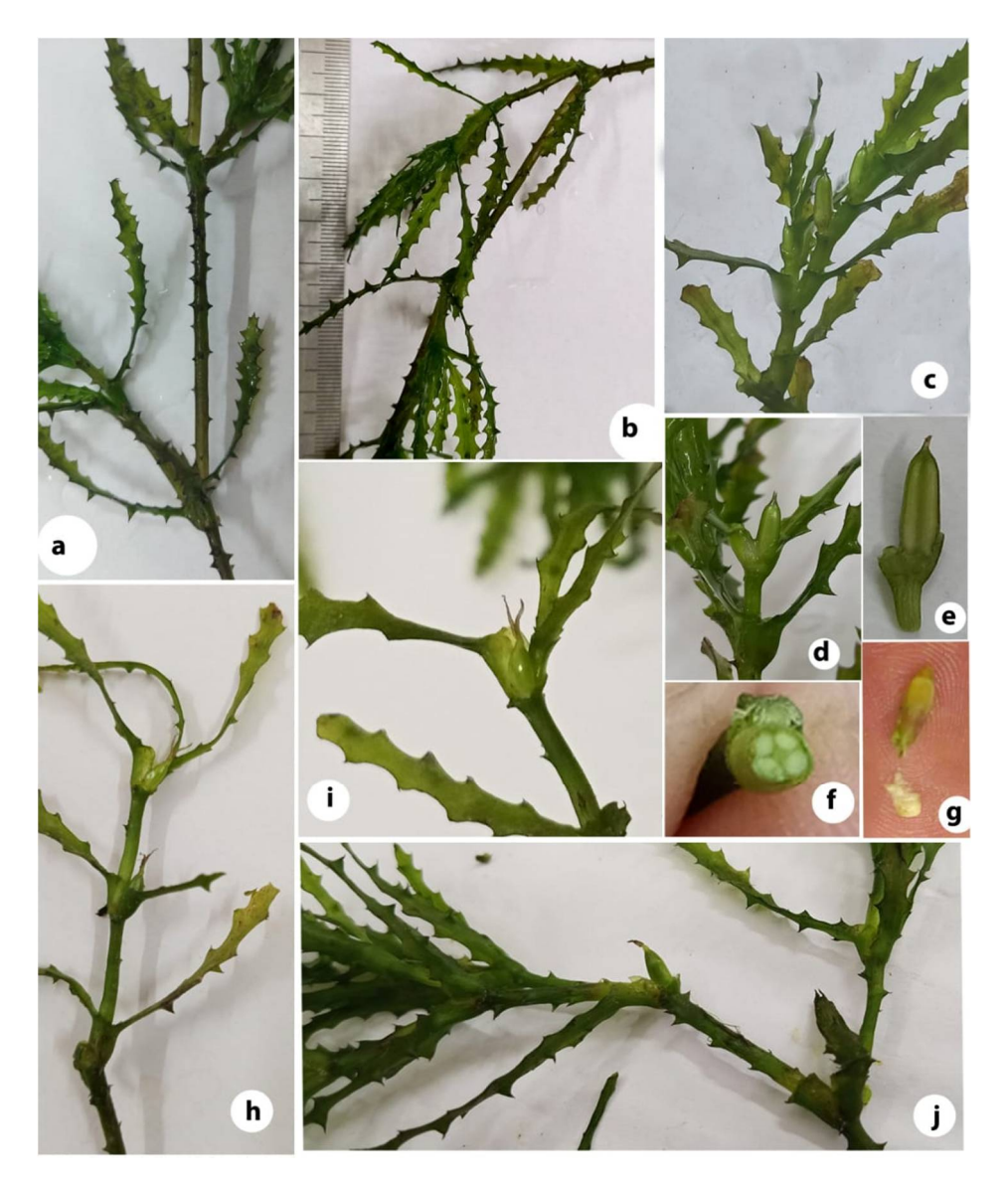
Fig. 2 (a-j). a. Stem with arrangement of spines, b. Leaves showing dorsal spines, c. Male flower of Najas marina with spathe protruding above the anther to form characteristic spines, d) single flower with characteristic crown, e) Longitudinal section of the flower, f) transverse section of the flower showing 4 locules, g) Dense clouds of pollen grains being released, h-i) Female flowers of Najas marina in a fertile shoot, j) Fruits producing in the fertile shoot.

The phase during which the male flowers have a pale colour provides a reliable field diagnostic feature but this was evident only during August of the year (Fig. 2c-g).