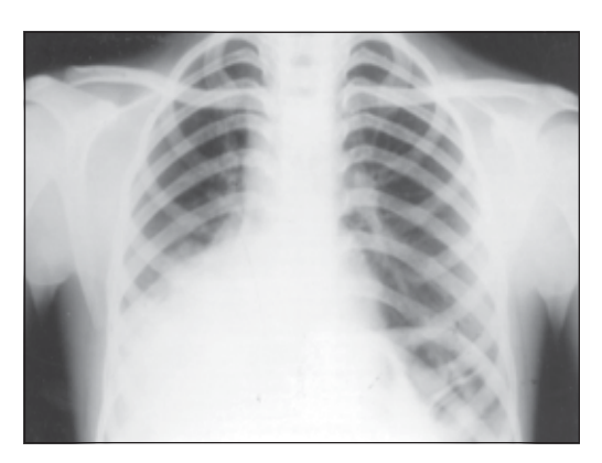
Figure-3: X- ray chest PA view showing collapse of right lower and middle lobe.

X-ray chest PA view (Figure-3) revealed silhouetting of right dome of diaphragm and right cardiac border suggestive of consolidation/collapse of right lower and middle lobe.