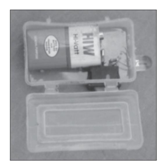
Figure 1: Battery showing glass bulb

A 12-year-old male child present to ENT OPD, MDM Hospital, Dr. S.N. Medical College, Jodhpur, Rajasthan, India with the history of inhalation of a glass bulb 10 days back while playing with a special kind of a battery (Figure. 1 & 2) used with Gobar Gas plant. (It is a kind of a fuel production unit in villages, which use cow & other animal dung).