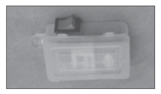
Figure 2: Battery showing glass bulb

He developed mild cough and breathing difficulty from last 5 days. On examination the child was tachyponeic with mild stridor and on auscultation air entry of right side was found diminished as compared to the left lung.