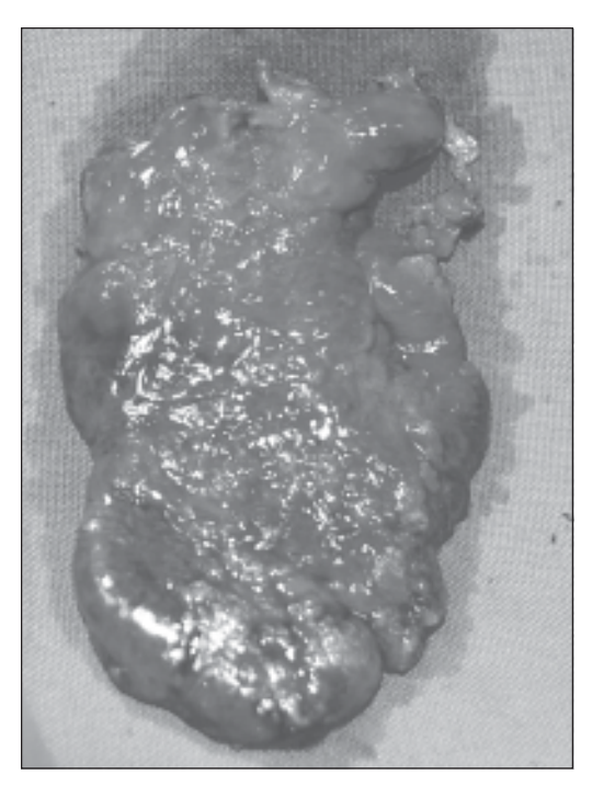
Figure-4. Haemangioma measuring 12 x 5 x 2 cms. Lobulated surface. Histpathological report onsistent with hemangioma.