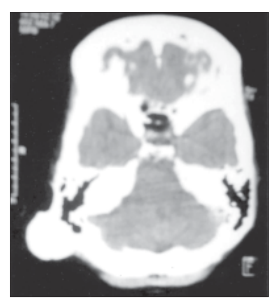
Fig.-2: Showing angular dermoid in the right mastoid area originating from the outer table of the skull with no bony erosion or intracranial extension.

disturbance or any neurological deficit. All routine investigations were within normal limits. X-Ray Mastoids Towne's view showed right mastoiditis. FNAC revealed no malignant cells. CT Scan finding was in favour of angular dermoid in the right mastoid area originating from the outer table of the skull with no bony erosion or intracranial extension.