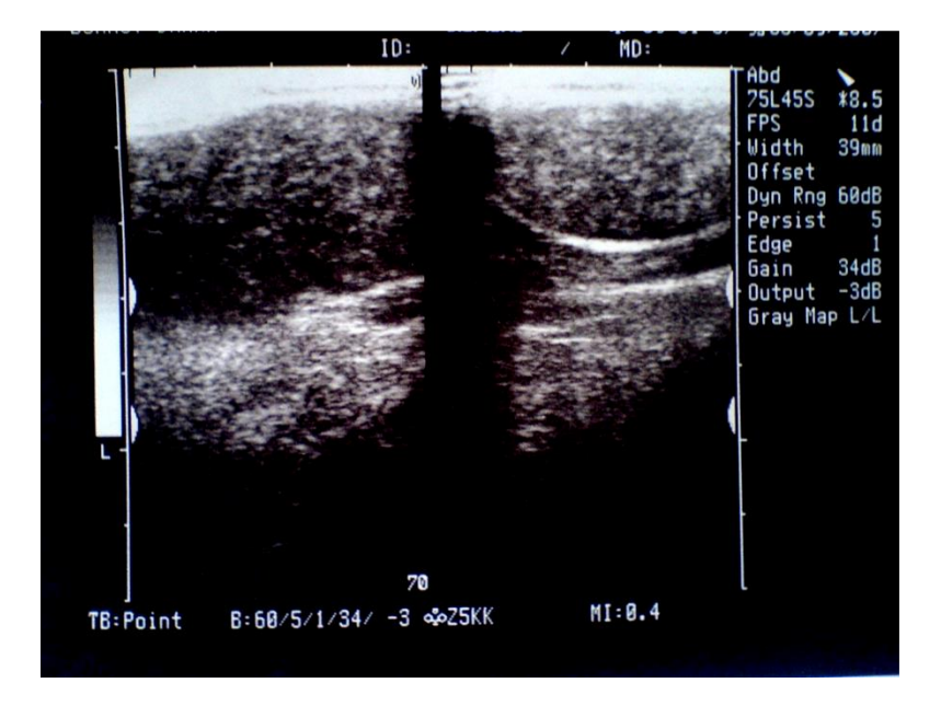
Fig IV: Epidermoid cyst: Midline suprahyoid, sub-mental mass showing moderately thin walled, unilocular cystic lesion having coarse internal echoes without posterior echo enhancement.