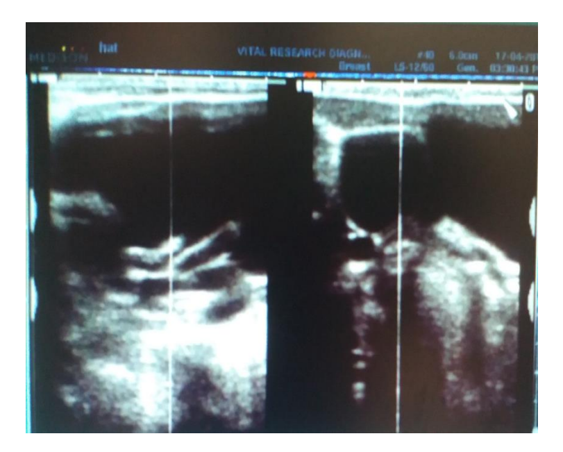
Fig II: Branchial cleft cyst: A lateral neck mass showing anechoic, thin walled septet cystic lesion with posterior echo enhancement.