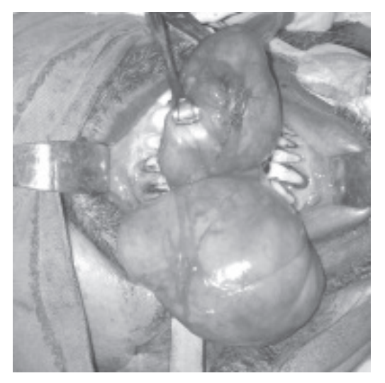
Fig.-2: Both oral and neck part of the lipoma

On both oral and neck palpation it was non tender, soft, fluctuant, compressible and mobile. No neck node was found palpable. Systemic examinations revealed no abnormities. Patient was non diabetic, non hypertensive, non asthmatic and no other comorbidity.