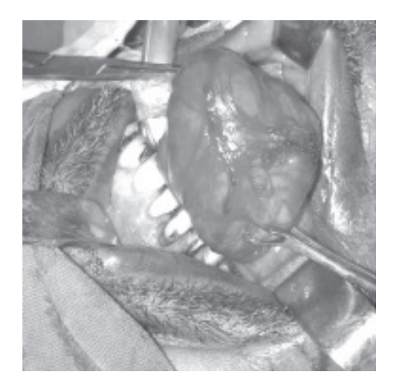
Fig.-1: Oral part of the lipoma.