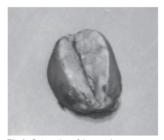
Fig-2: Cut section of the specimen

On cutting the specimen whitish fleshy tissue was seen without any cavitation. [Fig-2].