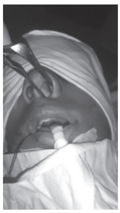
Fig-1: Septal deviation to the left