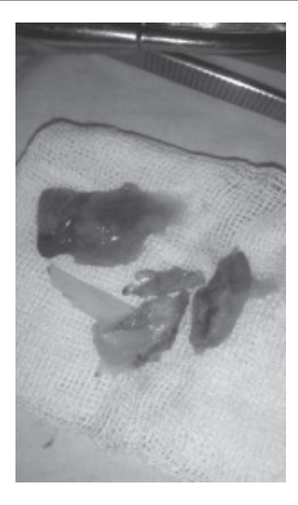
Fig-3: Resected specimens of adenoid, inferior turbinate, part of septal cartilage and bones