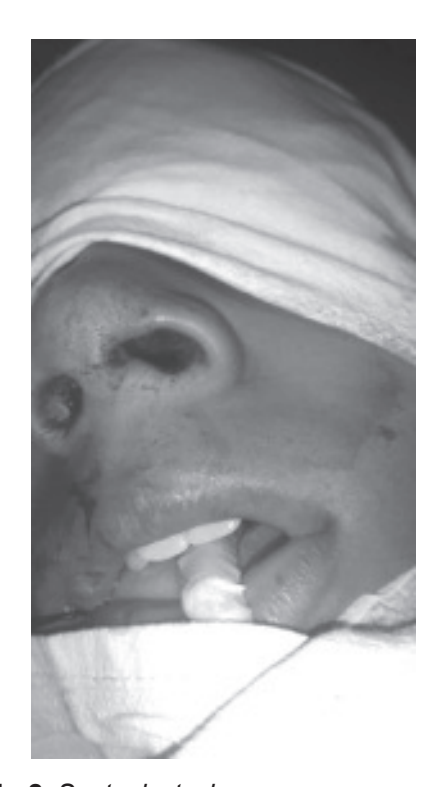
Fig-2: Septoplasty done