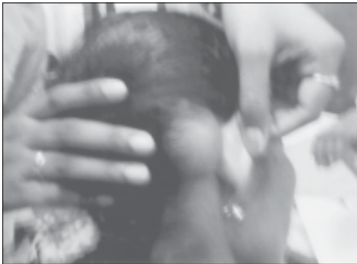
Fig.-1: Showing stony, hard swelling over right mastoid region.

A 35-year-old female presented with swelling, right mastoid region for the last 25 years. It was found to be oval in shape, 3cm x 5cm in size, stony hard in consistency, non-tender, free overlying skin but firmly adherent to the underlying bone.