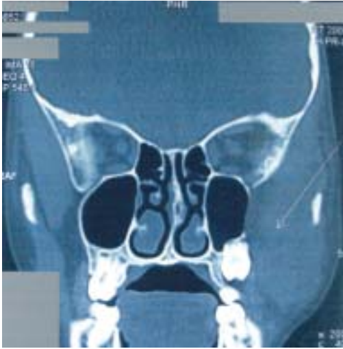
Fig.-2. Photograph of CT scan (Axial) showing the mass and destruction of left coronoid process of mandible (indicated by arrow)