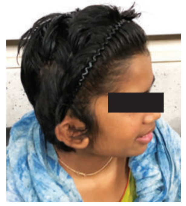
Fig.-9: Post-operative picture.