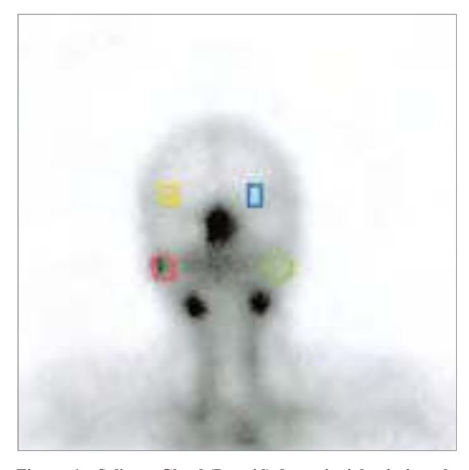
Figure -1a. Salivary Gland (Parotid) dynamic sialoscintigraphy

The study was conducted after the radioiodine therapy of about 1.8~2.3 years. This studyshowed that incase of right parotid gland, among 06 male patients 50% and 53.3% had decreased salivary function. About 50% male and 55.6% female had decreased left parotid gland salivary gland dysfunction. About 33.3% male and 11.1 % patient had right submandibular salivary gland dysfunction. This study also showed that 16.7% male patient's and 6.7% had female patient's had left submandibular dysfunction.