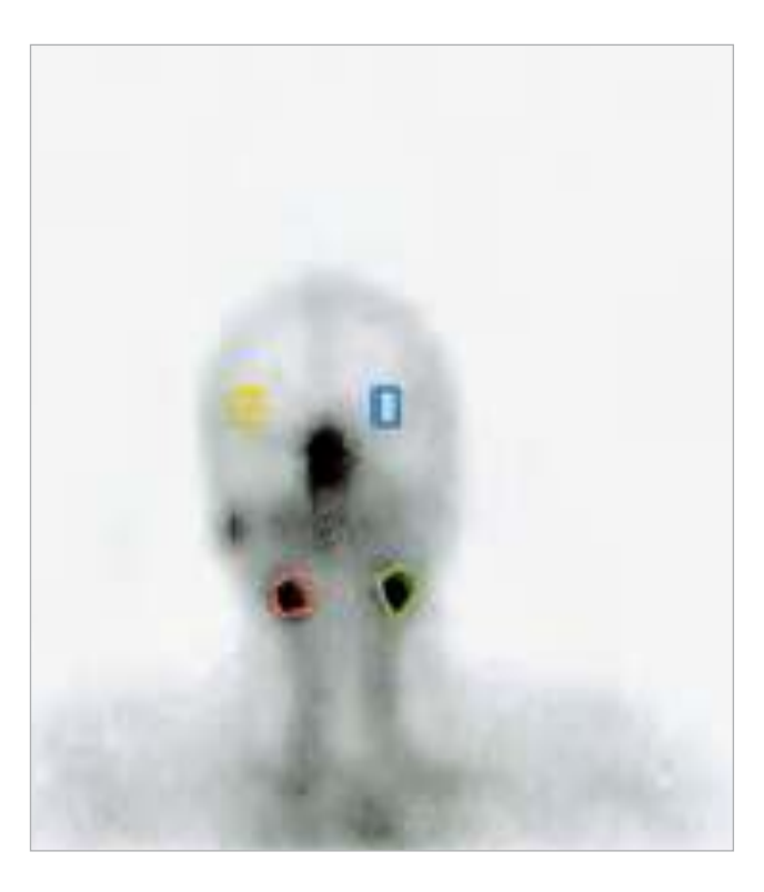
Figure-2a:Dynamic Sialoscintigraphy of both submandibular salivary glands.