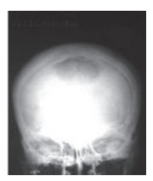
Fig.-1: The patient with midline frontal swelling and x-ray skull shows big oesteolytic lesions.