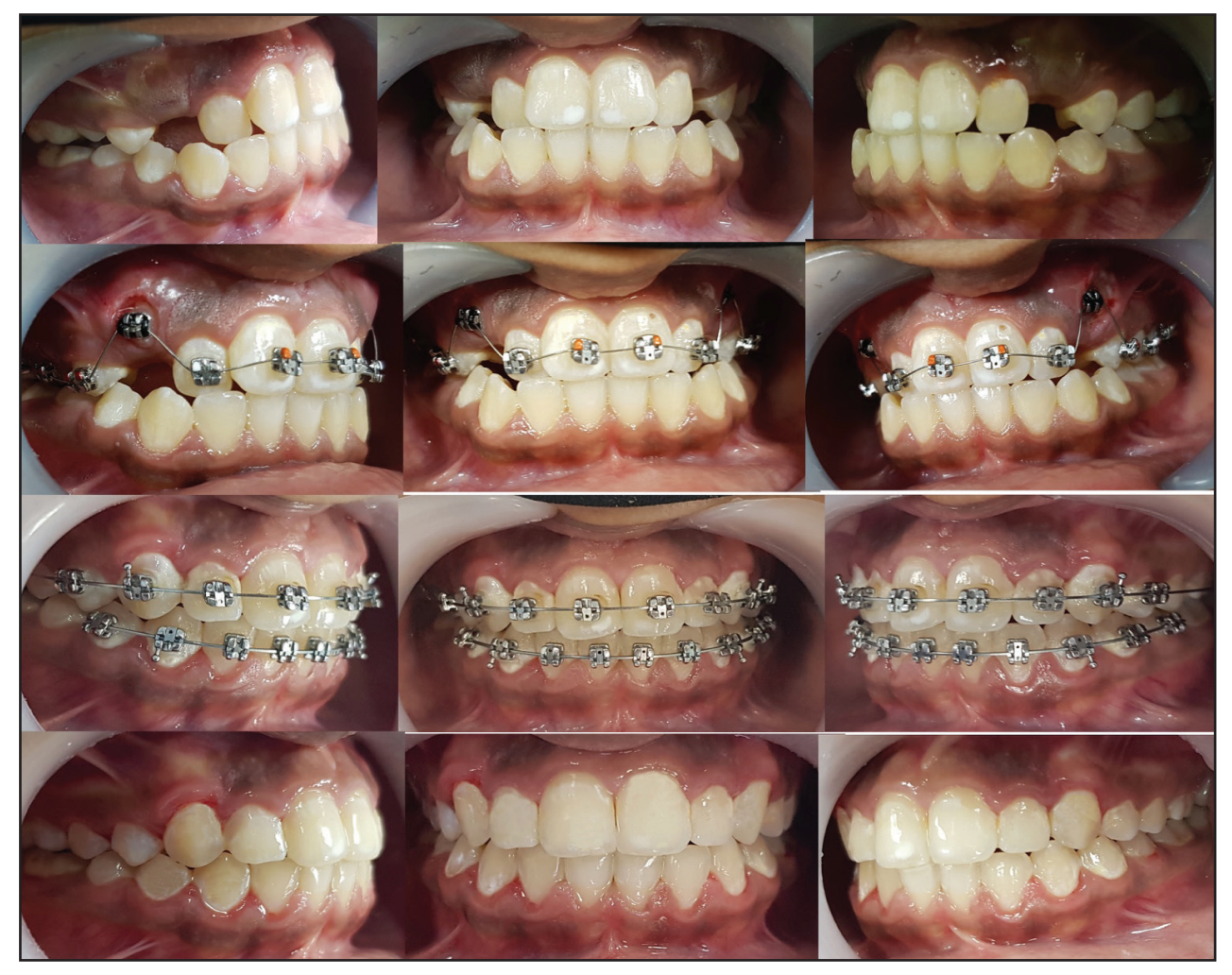
Figure 1. Intra oral potographs of present case. Upper row – pre-treatment photographs, 2nd row – BIMC and bonded upper fixed orthodontic appliances, 3rd row - finishing stage and bottom row – after debonding.

The duration of the active orthodontic treatment was 14 months which was followed stabilizing and finishing with bonded rigid wires. Following the removal of orthodontic appliances, essix retainers were given for both the arches. Active orthodontic treatment and orthodontic traction lasted for 18 months and the patient cooperation, excellent maintenance of oral hygiene was appreciated during the entire duration of treatment. The clinical status and the radiographic results at the end of treatment were excellent and were in line with the expected/desired outcome (Fig 2 and 3). The patient was satisfied with the results of our treatment methodology and is under regular follow up.