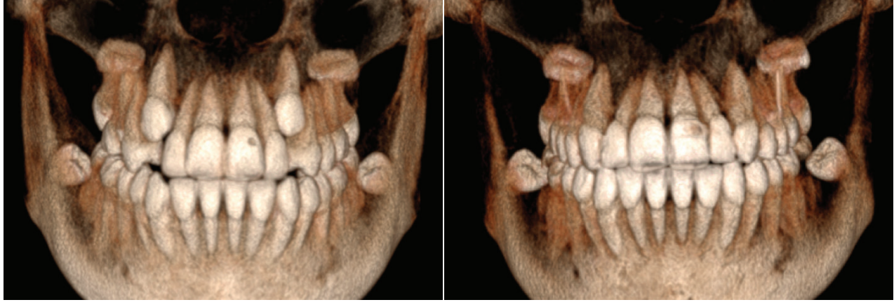
Figure 3. CBCT frontal view image, pre [right] and post [left] results.