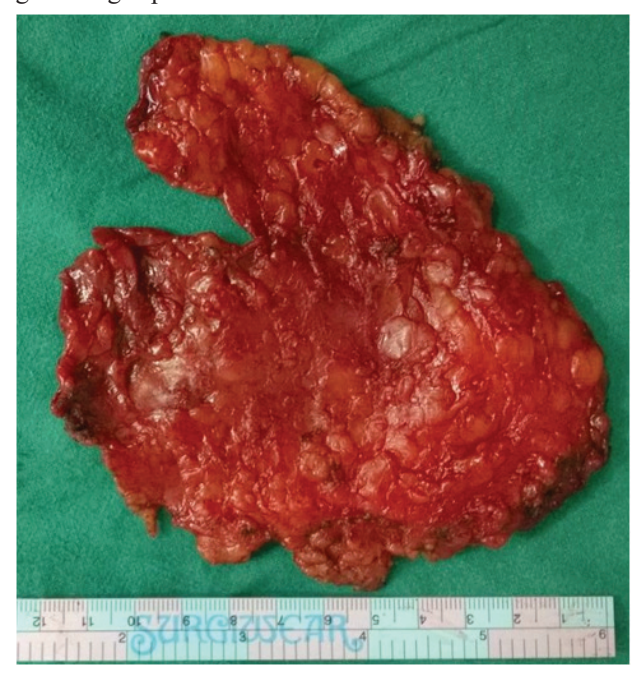
Figure 4: Excised specimen.