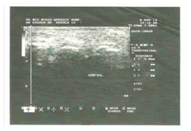
Figure 2: Showing the Sonogram of the Metatarsal fat pad.