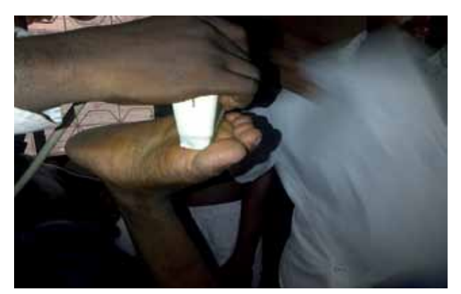
Figure 1: Measurement of the thickness of metatarsal fat pad

The subjects were made to lie in a prone position on a