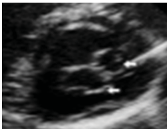
Fig 2: Short axis parasternal view shows double-orifice mitral valve

occupies roughly the remaining two-thirds of the annular circumference. In a DOMV, however, abnormal tissue divides the mitral orifice into 2 parts 2 . The mitral valve can function reasonably well in about 50% of patients with DOMV. The commonly associated lesion is atrioventricular septal defect, VSD, coarctation of aorta, interrupted aortic arch, patent ductus arteriosus, primum atrial septal defect, tetralogy of Fallot, and ebstein anomaly 3 , but in this case there was no such lesion.