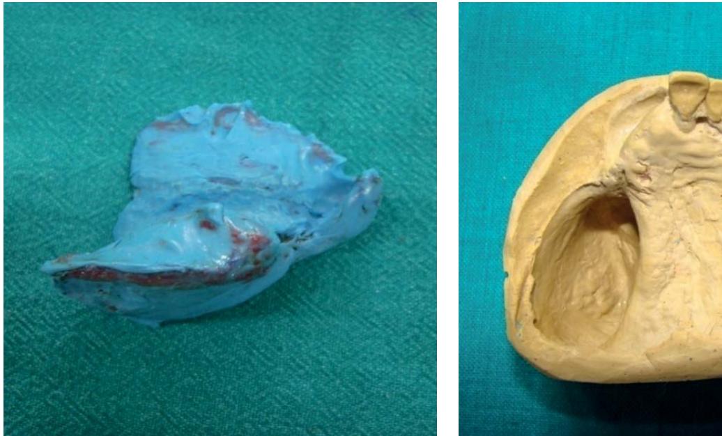
Figure 1: Final impression made in elastomeric impression material.

The obturator can have basically two types of bulb designs, solid and hollow.<sup>3</sup> Brown has suggested to lighten the obturator in order to improve the cantilever mechanics of the suspension and to avoid overtaxing the remaining supportive structures.<sup>4</sup> The hollow bulb design can again be of closed and