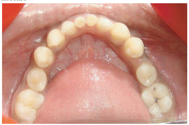
Figure. 3: Mandibular arch shows multiple missing teeth, retained 71&81 and rotated second premolars

Maxillary permanent canines cusp tip appear sharp and pointed. Maxillary and mandibular premolars appear smaller in size. Maxillary right first premolar was placed palatal in relation to maxillary right canine. Maxillary left first, right second and mandibular both second premolars were mesiolingually rotated. Maxillary both first molars were also