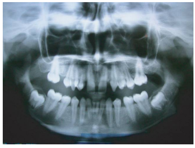
Figure.5: Orthopantogram shows multiple missing teeth 12,22,17,18 ,22,27,28, 31, 41, 38& 48 and retained 52,71& 81.

rotated mesiopalatally. Spaces were present in between 11& 21, 21&23, 23&24, 11&53, 53&13,15&16, 43&44, 44&45, 34&35. Pulp canal exposure and attrition were seen clinically in 71&81. Retained deciduous tooth 52 was present. Occlusal caries were noted in 26 and 36. 14 was in crossbite relation [Figure.2&3]. Lower incisors teeth were retroclined and anterior deepbite present [Figure.4]. The orthopantomographic examination