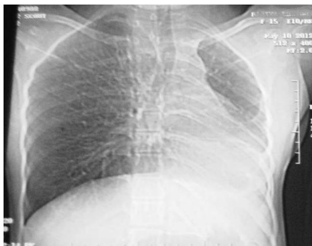
Figure I: Chest x-ray PA view showing left sided homogenous opacity with mediastinal shifting to left side

absent in the left hemithorax and percussion note was dull in the left side. Traube's space was situated in left fifth intercostals space. Her chest x-ray (CXR) showed left sided homogenous opacity with mediastinal shifting to left side [Figure I].